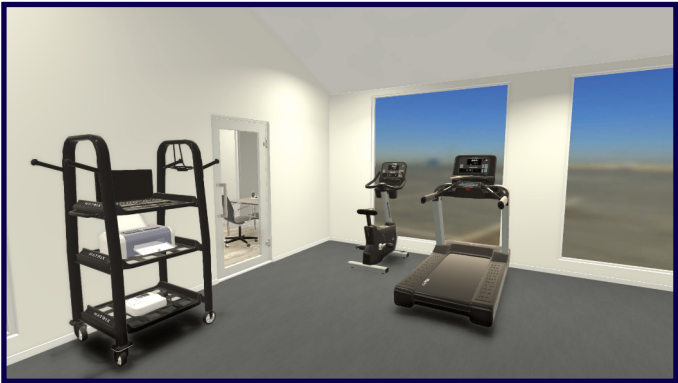
NEW Wellness Evaluation Room