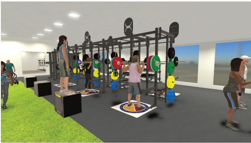
NEW 1,700 square foot High Intensity Interval Training (HIIT) Studio