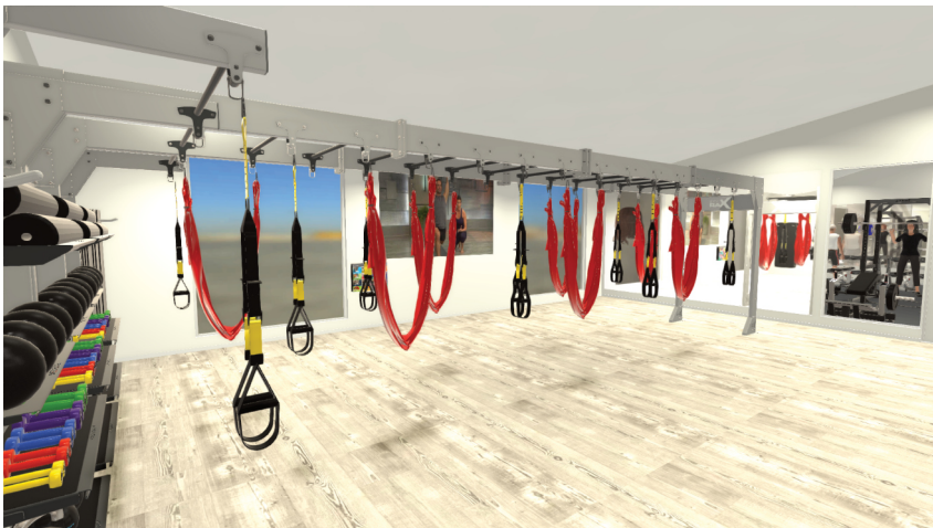
NEW 740 square foot Group Exercise Studio