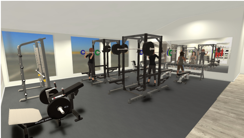
Expansion of current fitness center by 850 square feet