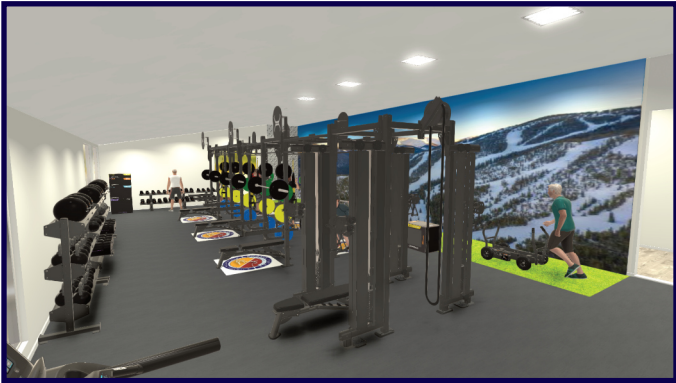
NEW 1,700 square foot High Intensity Interval Training (HIIT) Studio